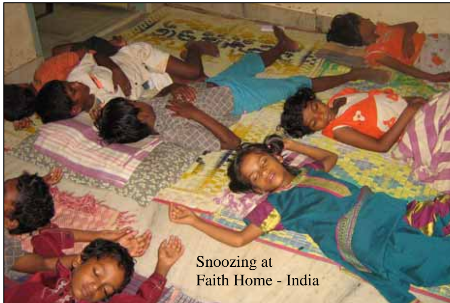
Snoozing at Faith Home - India

2) Kenya Nursery Schools – support Christadelphian and destitute children from the communities by sponsoring 1 of these 2 schools. For $30CAD/mth you give these children food, clothing, education and health care in a group environment. These projects have also been great outreach tools as several of the children and their parents from the community now attend ecclesial functions.