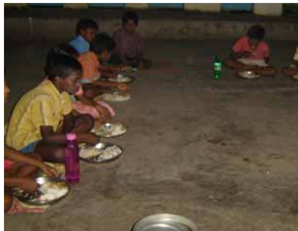
Dinner time at the India Faith Home