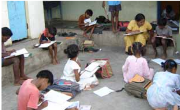
Homework time at the India Faith Home