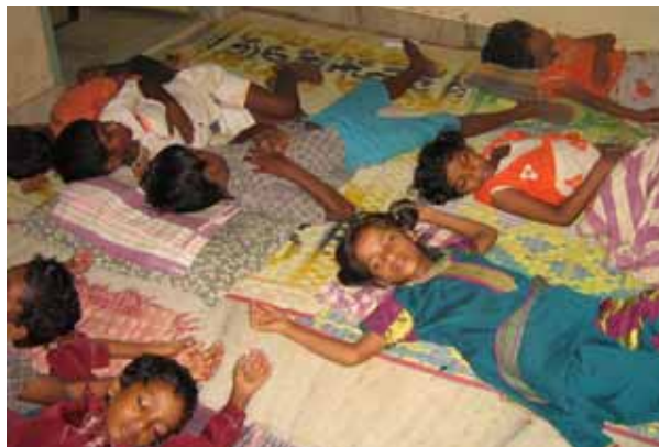
Sleeping inside on a rainy night