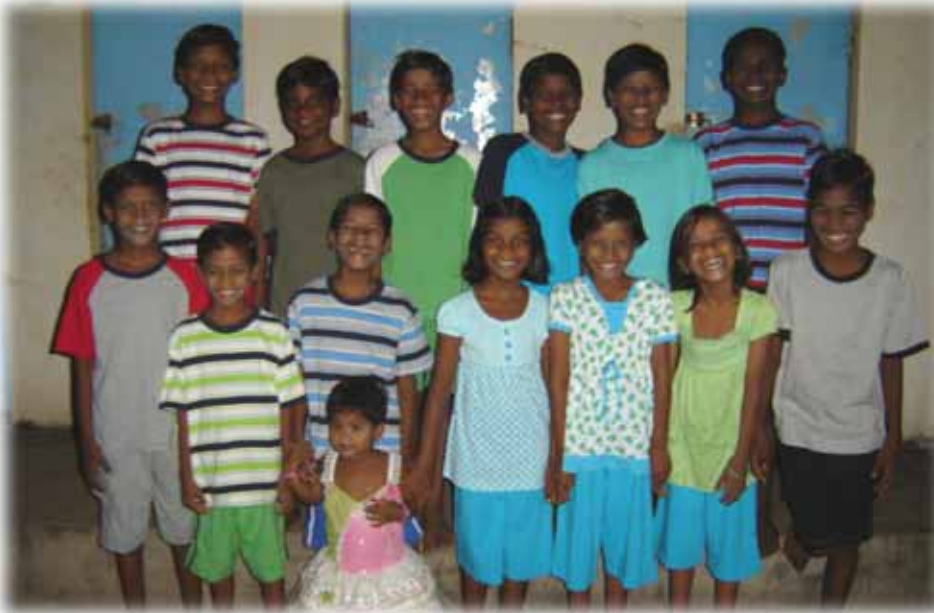
New Classroom at the Bukigai Day Nursery School - Uganda